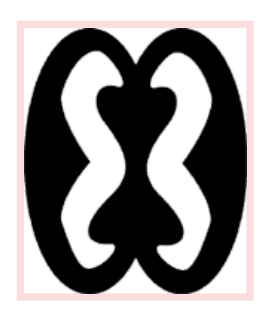
NKONSONKONSON "chain link" symbol of unity and human relations A reminder to contribute to the community, that in unity lies strength